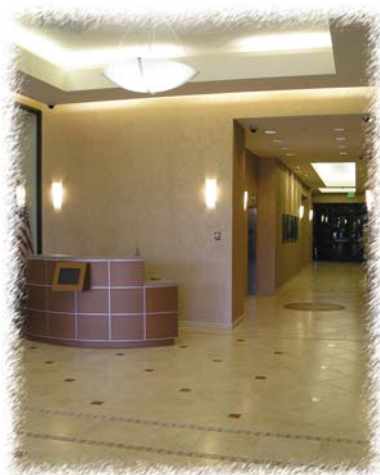
The ground floor renovation of the City National Bank Tower.

Upgrades to the 15 th floor have been com-